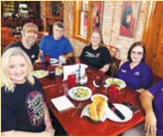
A Merry & Bright Single Public Space Winner: Village de Memoire

Once again, EHDOC challenged our properties to send in their photos of holiday decorating around the community. We enjoyed all the festive pictures that showed imagination and special holiday cheer! Winning properties were chosen in two categories: