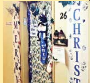
Holiday Spirit Community Wide Winner: Sunshine Center