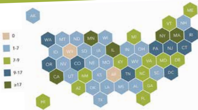
Figure 1: Number of Programs by State