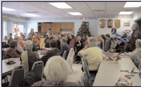
Christmas with Gilbert School 2nd graders and residents.

Sunshine Center residents were presented with a quilt from a local gift store, The Rabbit Patch. Residents enjoyed their gifts and the festive Christmas luncheon.