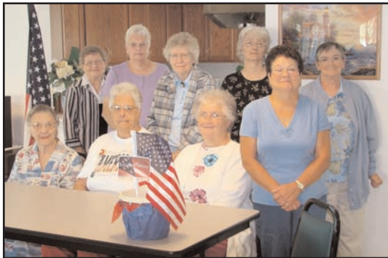
Maine residents worked on the Adopt-A-Platoon program.